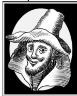
Guido (Guy) Fawkes 1570-1606

Unfortunately for him, Guy Fawkes was guarding the gunpowder in the cellar when the King's men stormed it in the early hours of 5 th November. He was caught, tortured