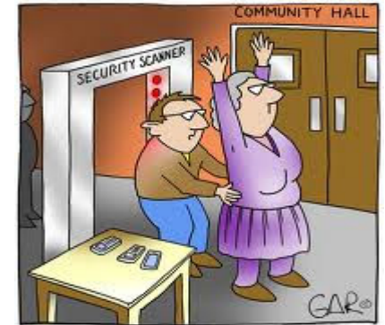
"Sorry Mable, you know the rules, no mobile devices allowed on quiz nights."