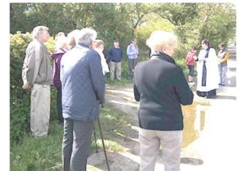
The two photos above show a few of the congregation on the walk (this time from Felmersham to Sharnbrook) on Rogation Sunday in 2012.

This was a very festive custom and food and drink (and I mean drink!) were taken along. Instead of the custom of taking food and drink on the walk, these are to be provided by Felmersham church congregation after the walk, followed at 6.00pm by Choral Evensong. Do come along and join us, the more the merrier. If you are unable to join us on the walk please join us for tea and then Evensong at 6.00pm.