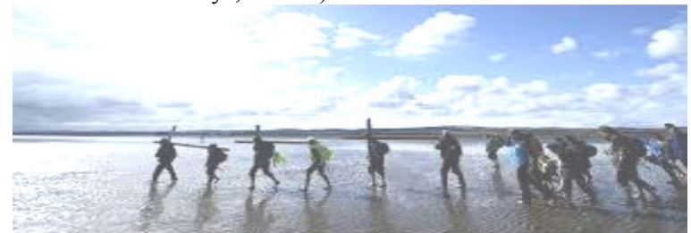
Pilgrims crossing the causeway to the Holy Island of Lindisfarm