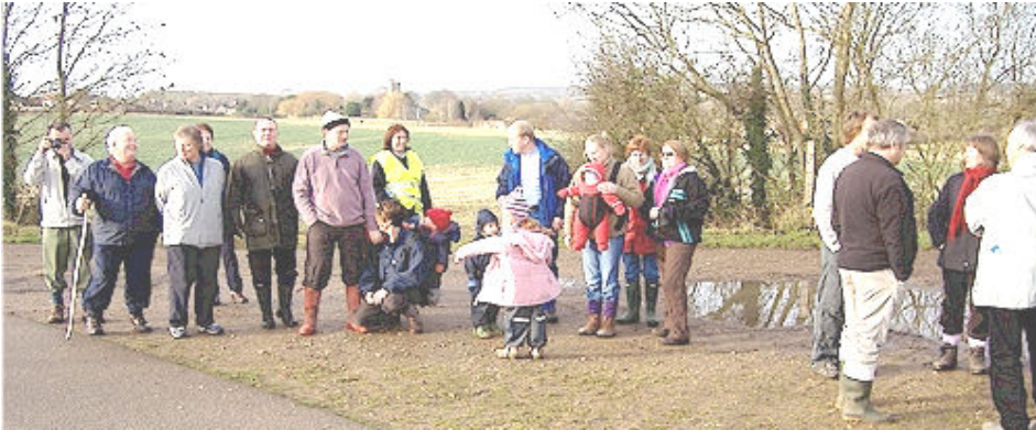
Photo: Annual Boxing Day Walk

I would like to extend an invitation to everyone to join us on our annual P3 Boxing Day walk and share in the festive spirit with your friends and neighbours whilst at the same time walking off those extra pounds! We meet at Felmersham bus shelter on Monday 26 December at 11.00am.